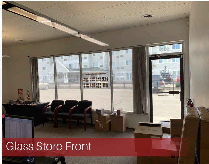
Glass Store Front