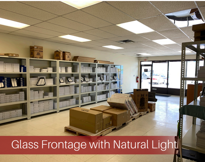
Glass Frontage with Natural Light