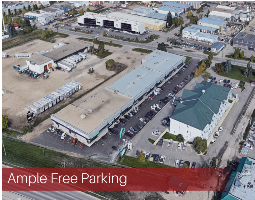
Ample Free Parking