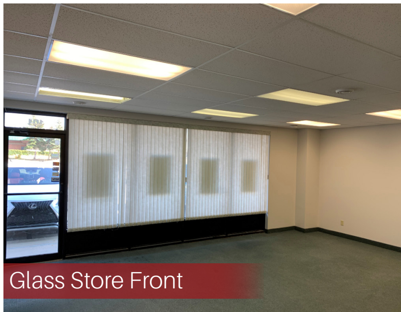
Glass Store Front