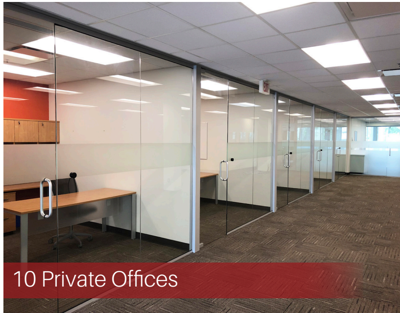
10 Private Offices