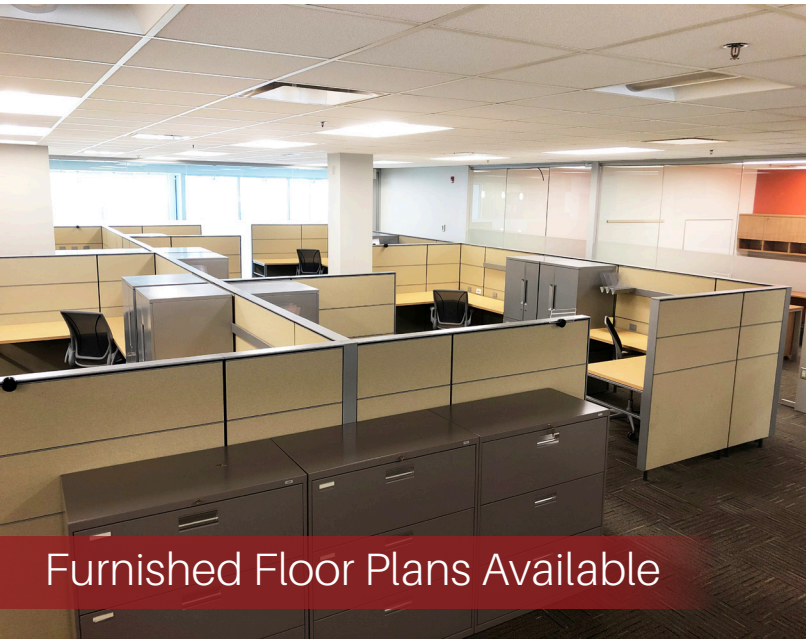
Furnished Floor Plans Available

FOR LEASE | 216 1st Avenue South, Saskatoon