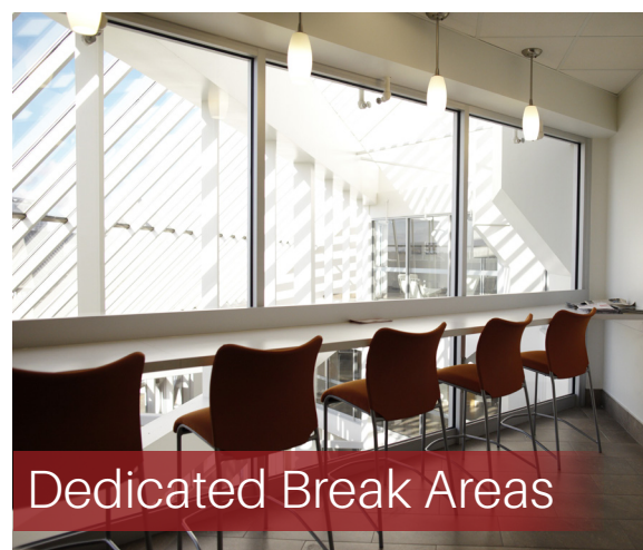
Dedicated Break Areas